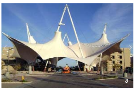
Figure 4: Robert Roithmayr: Bionic umbrella.

Figure 5: Two different (opposite?) approaches to design the edges of membrane structures.